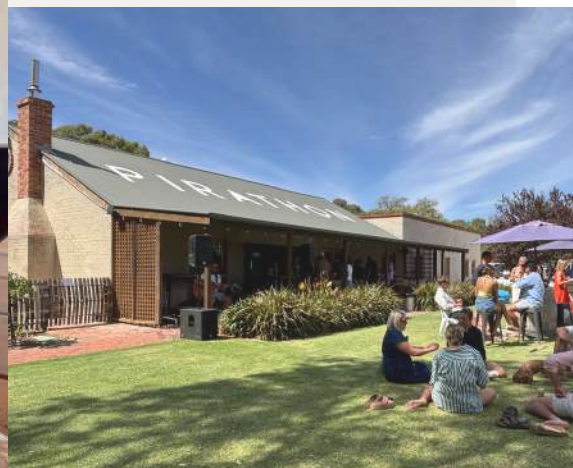
Grazing tables or Flammekauche Pizza