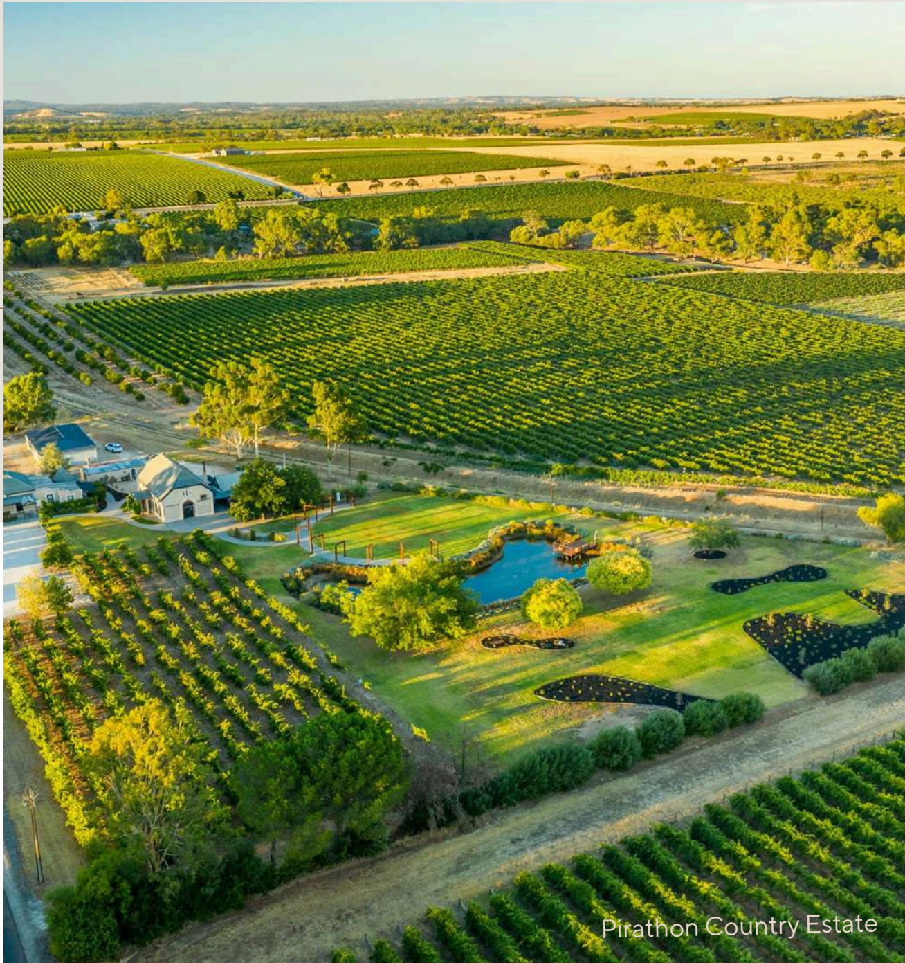
Pirathon Country Estate